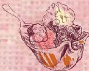
Table-Side Liquid Nitrogen Ice Cream